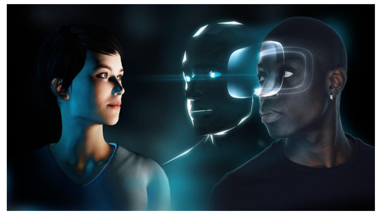
FIGURE 2: EYE CONTACT

object only based on the information of the movement of the hand controller, for example. When eye tracking is combined with gesture control, developers get two pieces of information: (i) how the hand controller moves and (ii) where the person was looking at the same time. With these two pieces of information, more accurate predictions and game experiences can be created.