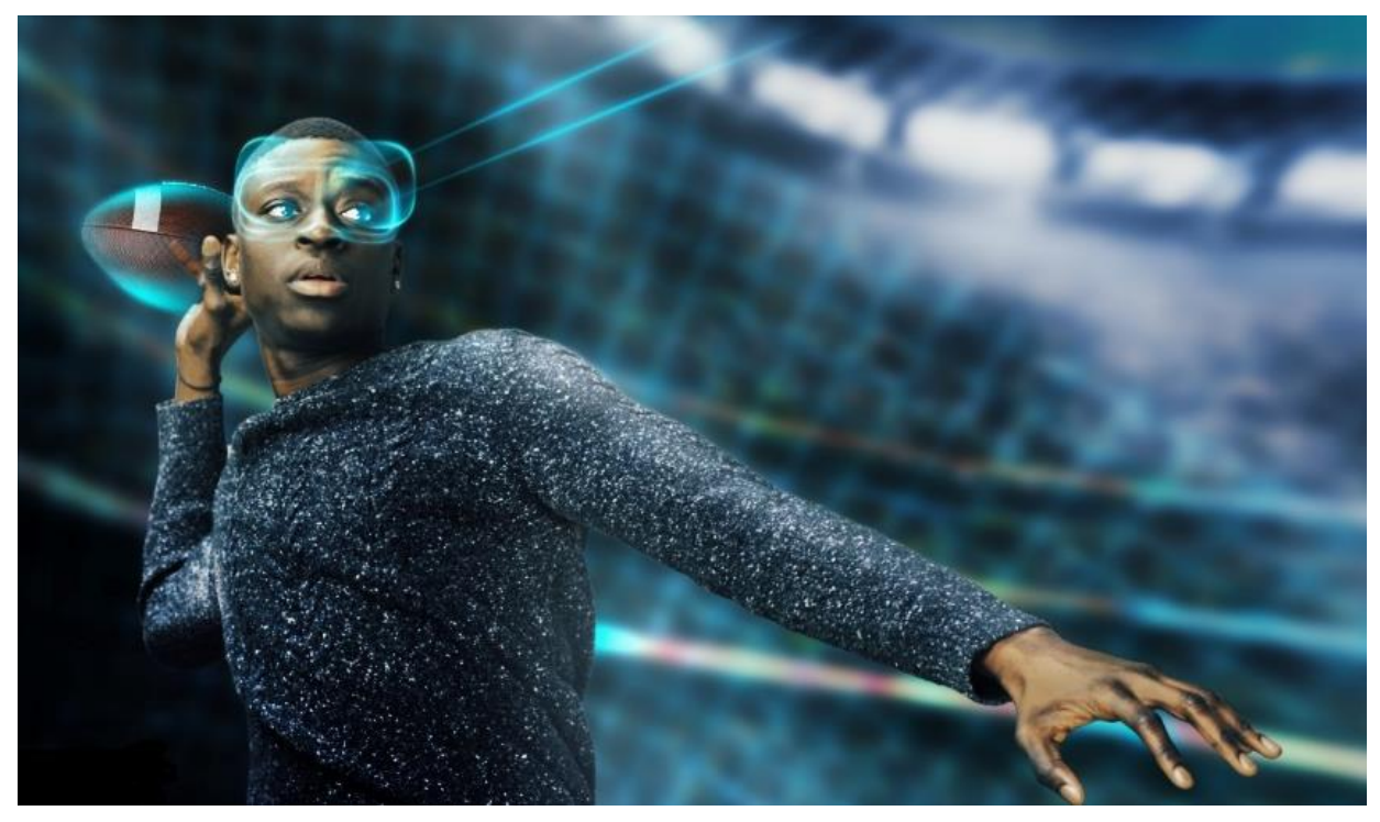
FIGURE 1: HAND-EYE COORDINATION

Ultimately, the most important purpose of eye tracking is to improve the user experience. We believe there are a few experiential capabilities that are gained using eye tracking, which help to improve the overall user experience beyond a headset without eye tracking. We also believe having these experiential improvements will help HMD manufacturers and application developers set themselves apart from the rest of the competition as more headsets enter and grow the market.