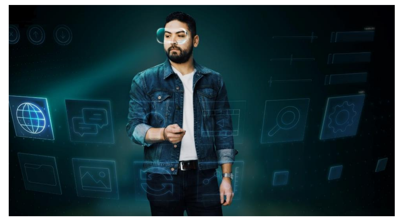
FIGURE 3: REDUCTION IN INTERFACE STEPS

tracking, game designers must guess what a user is focusing on and NPC responses are guesswork and often break immersion.